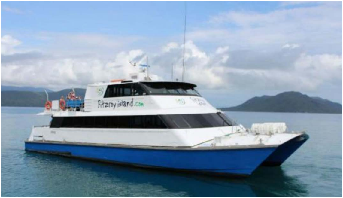
Figure 1: Fitzroy Flyer

At about 0700 Eastern Standard Time<sup>1</sup> on 29 March 2019, the master boarded the vessel to conduct pre-start up routines. Shortly after, three crewmembers boarded and prepared the passenger cabin for the daily operations. The first transfer of the day departed Cairns at 0800 and, at 1350, Fitzroy Flyer departed Cairns on its third transfer with 37 passengers on board.