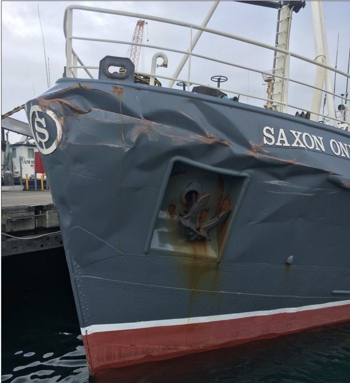
Figure 5: Saxon Onward, alongside in Eden