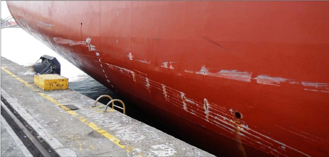
Figure 4: Beijing Bridge showing surface damage to the hull on the starboard side