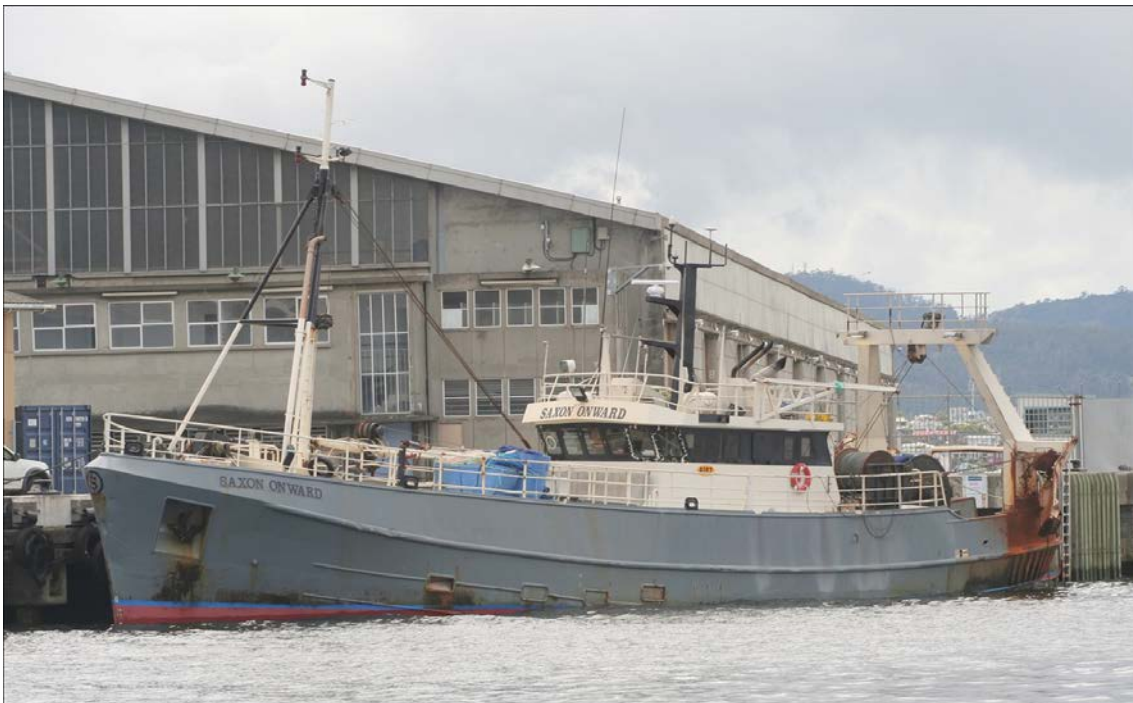
Figure 1: Saxon Onward , alongside in Hobart, Tasmania, 2010

On 23 January 2018, at about 0015 Eastern Daylight-saving Time, 1 the fishing vessel Saxon Onward (Figure 1) collided with the container ship Beijing Bridge (cover) about 3 nautical miles (NM) south-east of Gabo Island, Victoria. Saxon Onward was bound for Eden, New South Wales while Beijing Bridge was en route to Melbourne, Victoria from Taiwan.