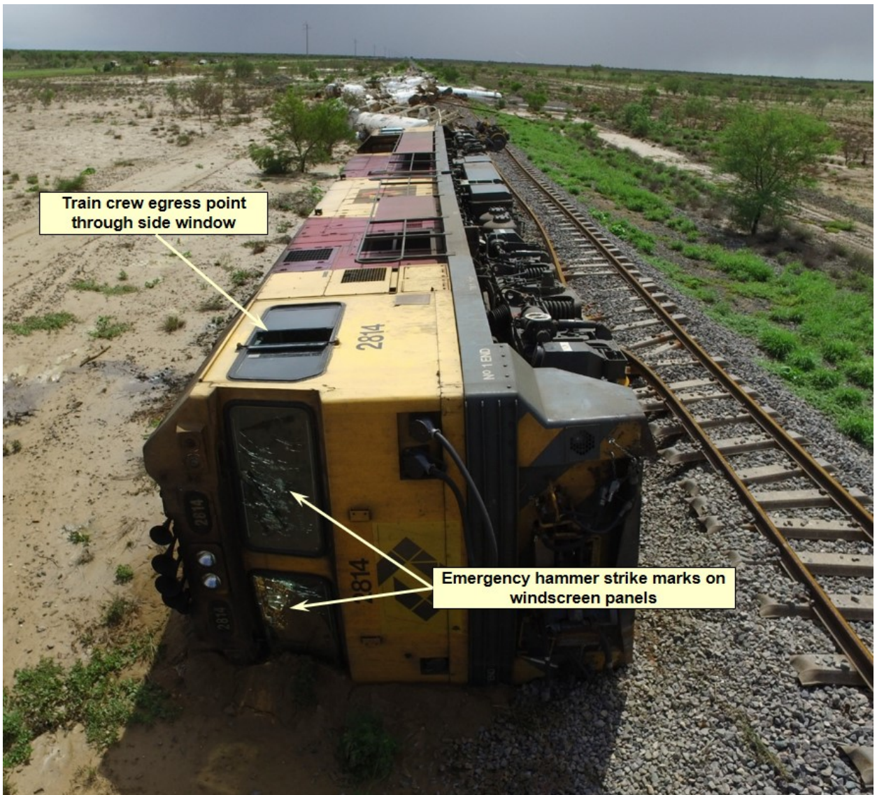
Figure 3: Derailed locomotive 2814

Derailed locomotive 2814 situated on the northern side of the track. The damage to the inside surface of both windscreens was from numerous strikes using the supplied emergency hammer. The train crew were unable to break out the windscreens. The train crew escaped from the locomotive through climbing up and out the sliding side window.