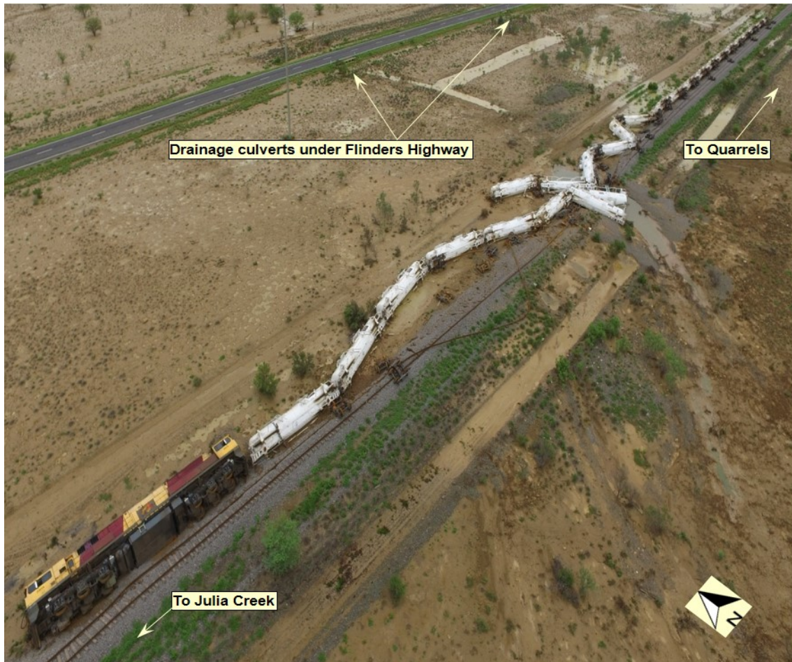
The derailed locomotive 2814 and 26 trailing tanker wagons of 9T92 laying to the north of the railway about 20 km east of Julia Creek. The floodwaters present at the time of derailment had receded, however pooled water is visible in the drainage channels from culverts under the Flinders Highway leading toward the washout of the track formation.

Immediately after the derailment, floodwater entered the cabin, before receding to a depth of about 600 mm. To escape the cab, the train crew attempted to break the front windcreens using