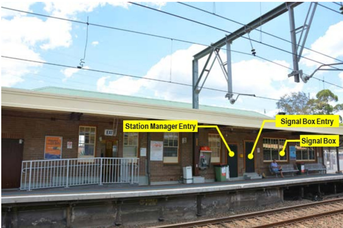
Figure 2: Platform 2 Morisset

The station consists of two platforms with the main office complex and ticket booking office located on No.2 Platform. A combined signal box and meals area is included in the main office complex. There are two access doors into the signal box, one directly from the platform and the other via the Station Manager's office (Figure 2). However, there were no instructions on either door for persons requiring access.