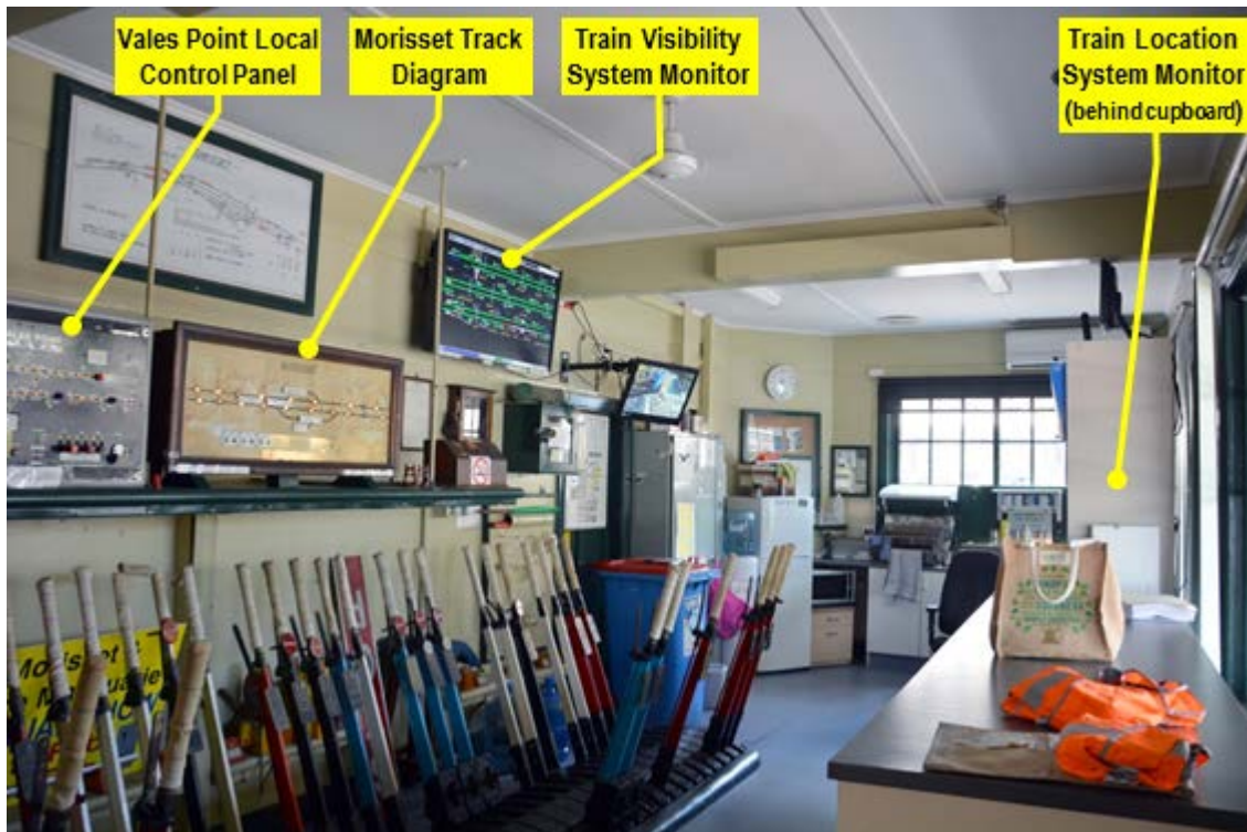
Figure 3: Morisset Signal Box