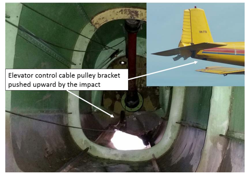
Figure 2: VH-TTD elevator control cable pulley