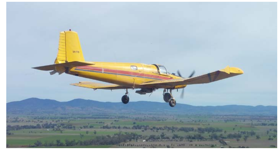
Figure 1: VH-TTD flying towards Tamworth Airport on the incident flight