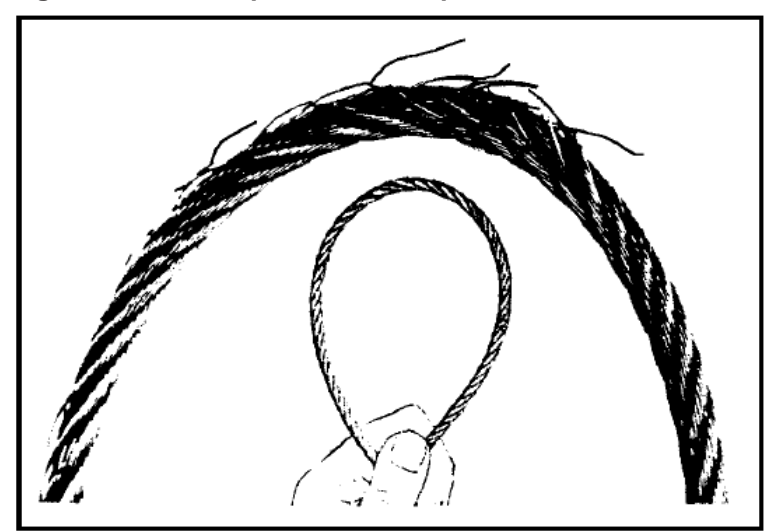
Figure 5: Cable inspection technique