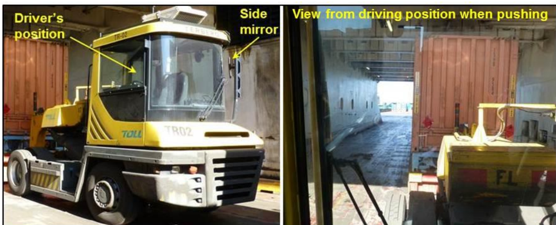
Figure 3: Tractor and driver's perspective

It was normal for loaded roll trailers to be pushed by the tractor onto the ship for loading onto the forward end of the weather deck. In this configuration, the driver's view ahead was restricted by the containers on the trailer (Figure 3). The driving position allowed for a clear view along the left hand side of the load but almost no visibility down the right hand side. The tractor was fitted a rear view mirror, but in the push configuration this mirror was positioned behind the driver and, hence, provided no assistance.