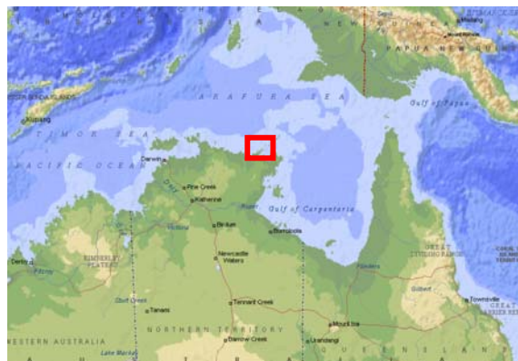
Figure 2: Location of communities