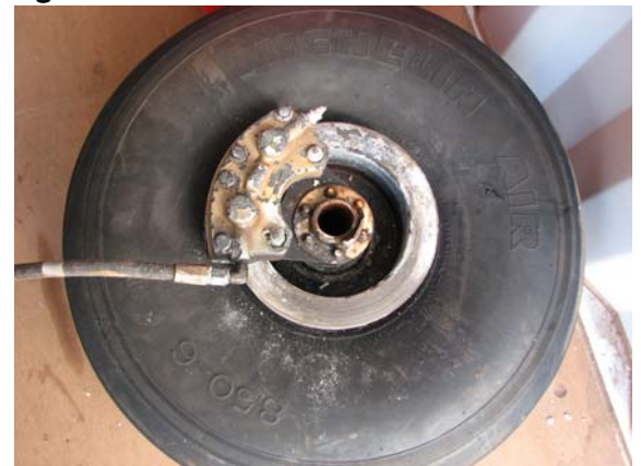
Figure 4: Left main wheel

Items of wreckage were recovered from the south-western part of Buckingham Bay by parties from Elcho Island and by the Australian Customs Vessel 'Roebuck Bay'. This included the left main wheel, the nose wheel, nineteen 20 L jerry cans, six seat bases, one seat back, and miscellaneous cargo, including school stationery (Figures 4 to 6).