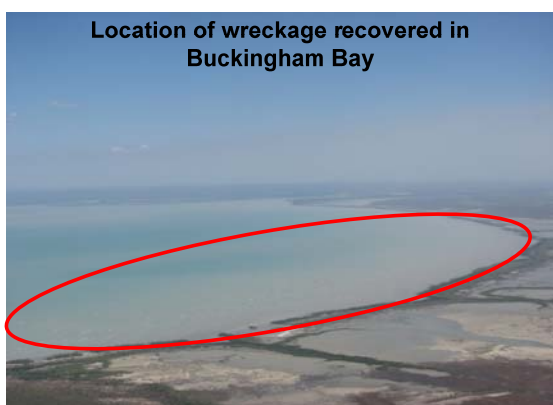
Figure 3: South-western part of Buckingham Bay

The weather on the morning of the accident was reported to have been fine. The maximum temperature that day in Nhulunbuy (Gove), approximately 130 km east of Elcho Island, was 30 °C.